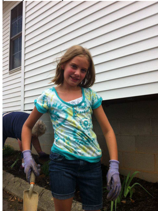
Pretty even when perspiring